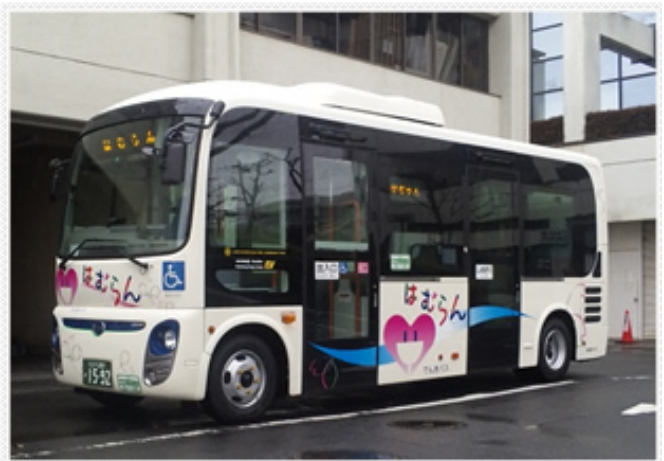
"Hamura's electric bus"