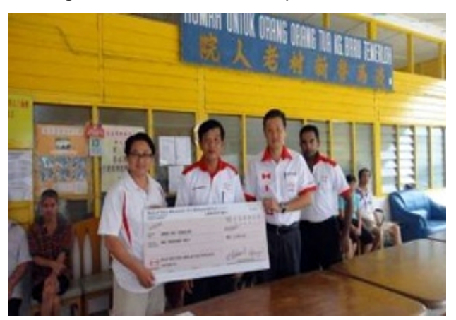
Hino Motors Sales (Malaysia) Sdn. Bhd. visited homes for senior citizens and made donations in Malaysia

Hino Motors dispatched instructors and donated engines and vehicles to primary, middle and vocational schools in Japan and around the world in fiscal 2012.