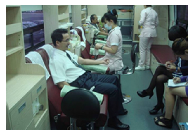
People giving blood inside the bus