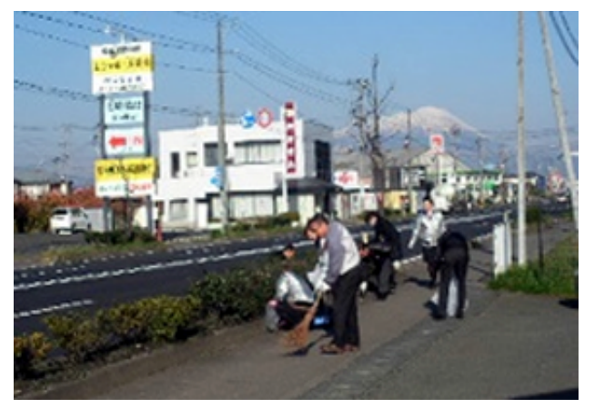
Iwate Hino Motor Ltd. held a cleanup event in the area surrounding its site in Iwate Prefecture, Japan