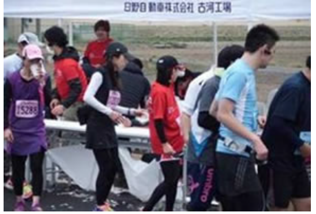
Employees from the Koga Plant participated in the Koga Hanamomo Marathon in Ibaraki Prefecture, Japan