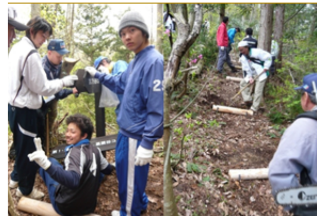
NEW A rural mountain area in Ishikawa Prefecture, Japan was maintained by J-Bus Ltd.

Tree planting and other rural regeneration initiatives were undertaken in Japan, Thailand, China, Vietnam, and Colombia.