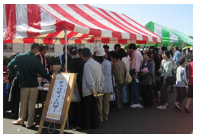
The Nitta Plant held an autumn festival in Gunma Prefecture, Japan