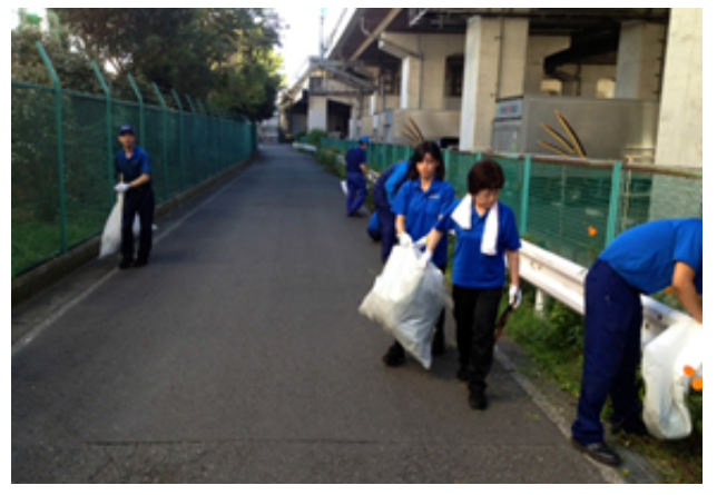
NEW Okamoto Logistics Co., Ltd. held a cleanup event in the area surrounding its logistics center in Kanagawa Prefecture, Japan