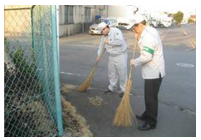
Cleanup activities were carried out around the site of Sankyo Radiator Co., Ltd. in Saitama Prefecture, Japan