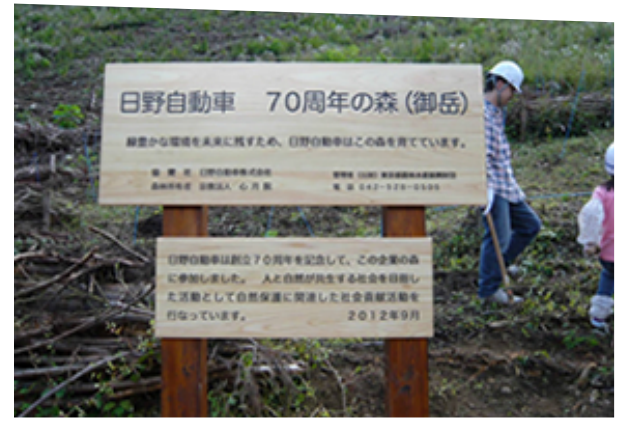
The commemorative sign at the forest