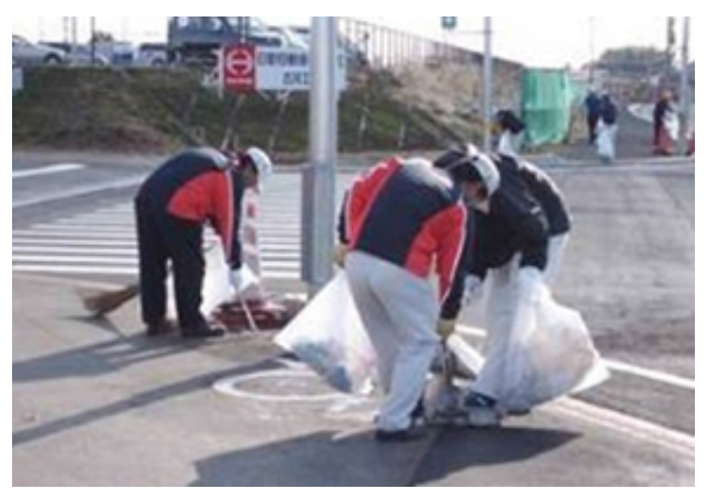
Employees collect trash around the Koga Plant of Hino Motors, Ltd. in Ibaraki Prefecture, Japan