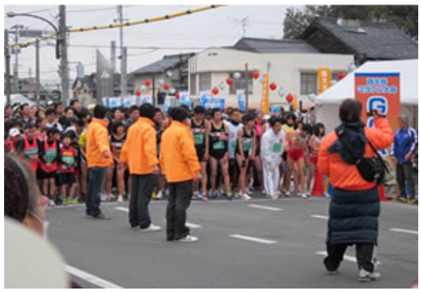
Employees of Okayama Hino Motor Ltd. took part in the Okayama Saidaiji Marathon in Okayama Prefecture, Japan