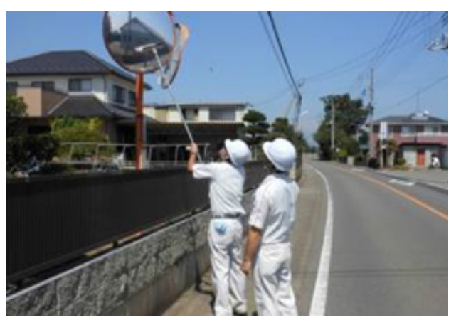
Employees clean traffic mirrors in the neighborhood surrounding the Nitta Plant of Hino Motors, Ltd. in Gunma Prefecture, Japan

Energy saving initiatives as well as activities cleaning up and beautifying areas surrounding business sites were carried out in and outside Japan.