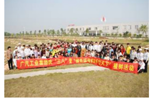
A tree-planting event organized by GAC Hino Motors Co., Ltd. in China

Employees of Hino Motors Vietnam, Ltd. carry out tree planting in Vietnam