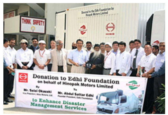
The donation ceremony held in Pakistan

In fiscal 2012, Hinopak Motors, Ltd. donated vehicles for use in the rebuilding of disaster-affected areas in Pakistan.