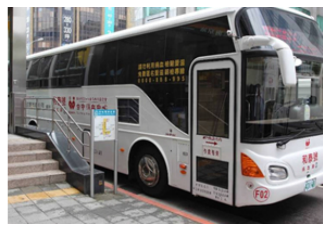
The blood-donation bus

Hino Motors' sales agent in Taiwan, Hotai Motor Co., Ltd., provided a blood-donation bus to the Tainan Blood Center as part of its social contribution activities.