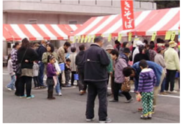
Hino Motors participated in the Gozenyama Festival held at the city ground of Hitachiomiya in Ibaraki Prefecture, Japan