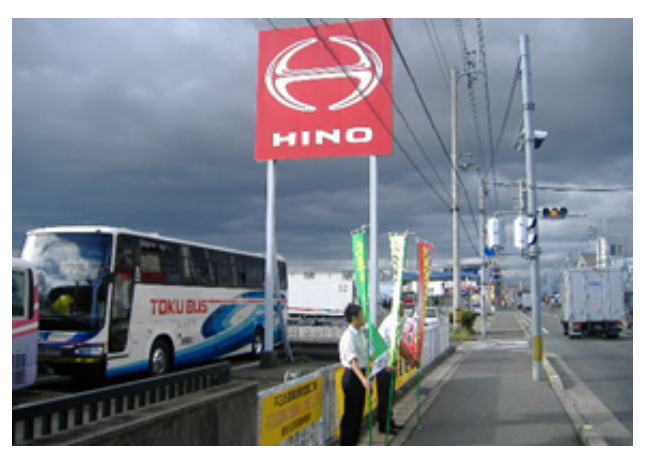
NEW Tokushima Hino Motor Ltd. holds traffic safety promotion activities