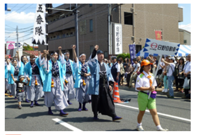
NEW Hino Motors Ltd. participates in the Hino Shinsengumi Festival held in Tokyo as an official member of the volunteer council