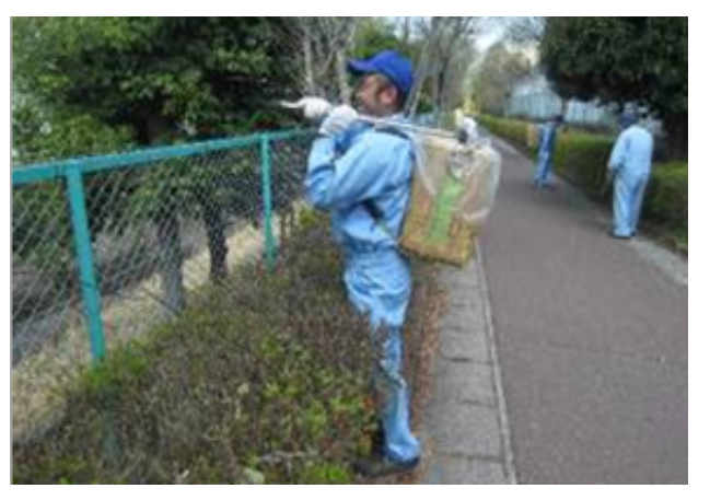
J-Bus Ltd. employees clean up the area surrounding their Plant in Tochigi Prefecture, Japan