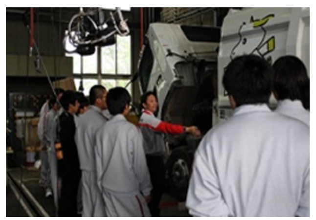
Higashi Hokkaido Hino Motor Ltd. offers tours of its repair workshop