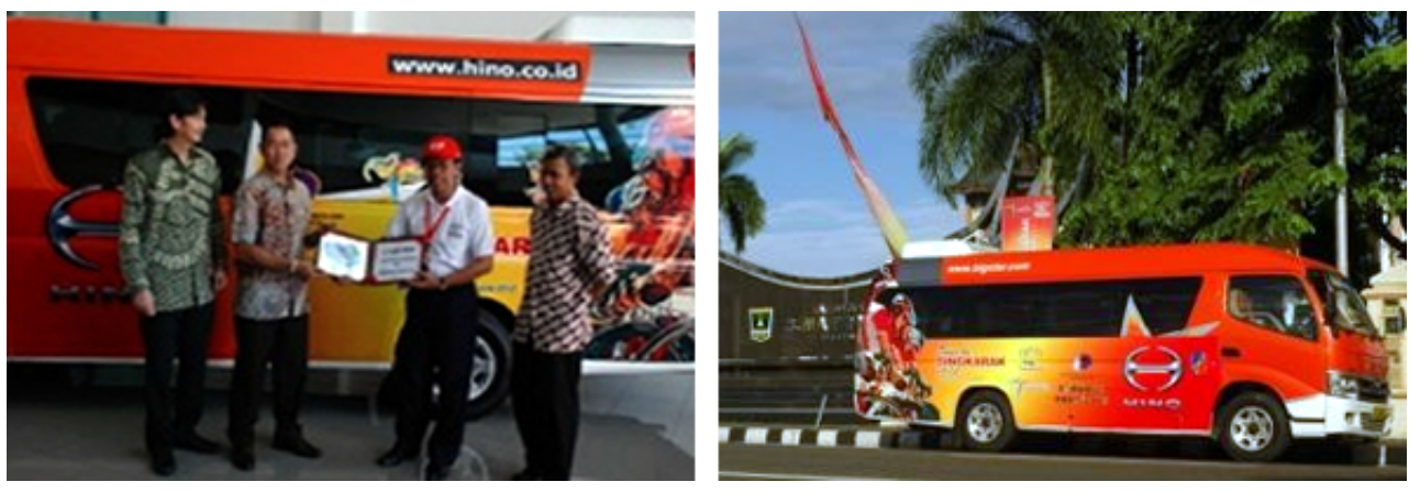
Hino small-sized buses provided for the race in Indonesia

PT. Hino Motors Manufacturing Indonesia and PT. Hino Motors Sales Indonesia provided four light-duty trucks and eight small-sized buses to the Tour de Singkarak international cycling road race held in West Sumatra, Indonesia. The vehicles were used for transporting bicycles used in the race and driving the cyclists.