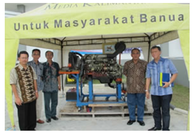
PT. Hino Motors Manufacturing Indonesia and PT. Hino Motors Sales Indonesia donated an engine to a vocational school in Indonesia