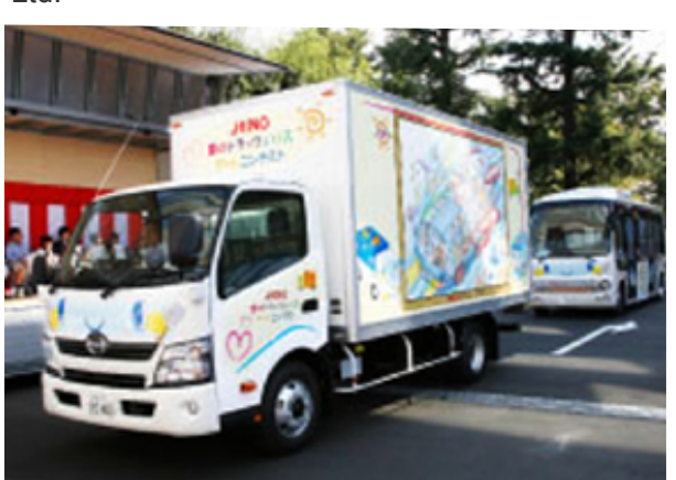
Vehicles were decorated by award-winning drawings for the anniversary event