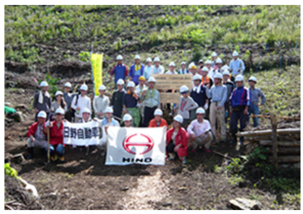
Employees planted the Hino Motors 70th Anniversary Forest in Tokyo