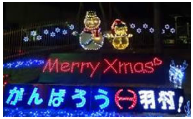
Christmas lights illuminated at an office building, gates in Hamura plant, Tokyo pleased not only employees but also the neighborhood