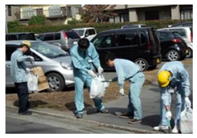
Cleanup activities were carried out around the grounds of Takebe Tekkosho Co., Ltd. in Kanagawa Prefecture, Japan