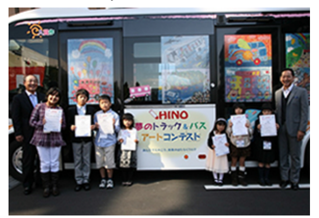
An awards ceremony for the Hino Dream Truck and Bus Art Contest was held in Tokyo, Japan

■ 70th anniversary celebration activities at Hino Motors, Ltd.