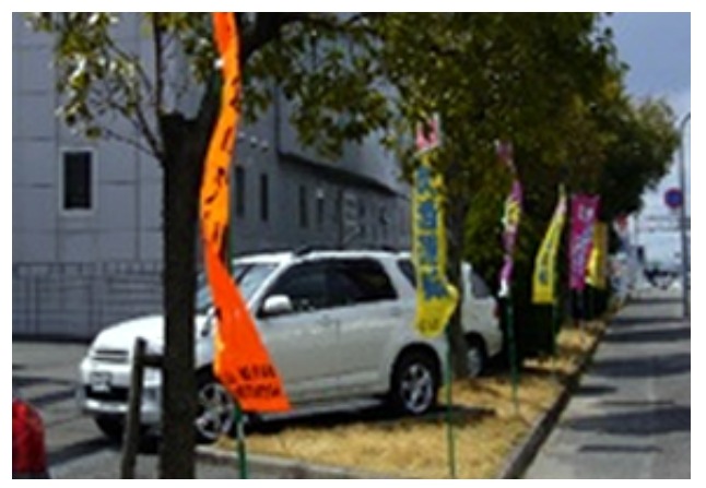
Okayama Hino Motor Ltd. received an award of excellence from the Okayama Prefectural Police headquarters in a traffic-safety promotion contest involving automobile dealers in the prefecture