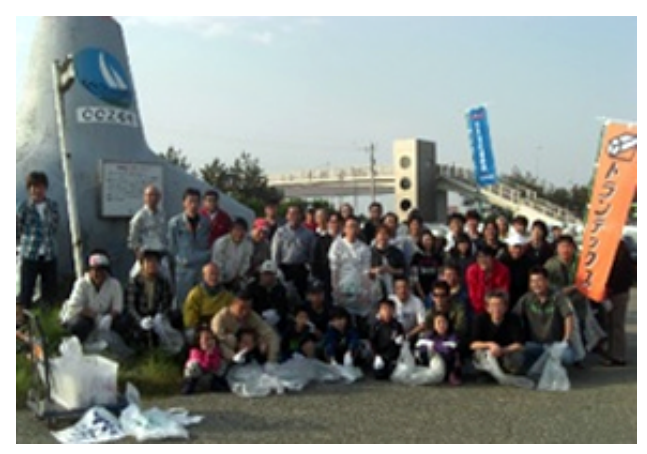
Trantechs, Ltd. participated in a beach cleanup in Ishikawa Prefecture, Japan