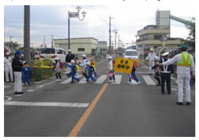
The Nitta Plant participates in guiding children on their way to and from school in Gunma Prefecture, Japan

Hino Motors Group companies in and outside Japan, including the Hino, Hamura, Nitta, and Koga plants, conducted traffic safety campaigns at their sites.