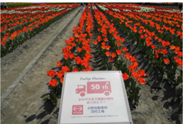
NEW The Hamura Plant participates in a tulip festival held in Hamura, Tokyo, the city where the plant is based