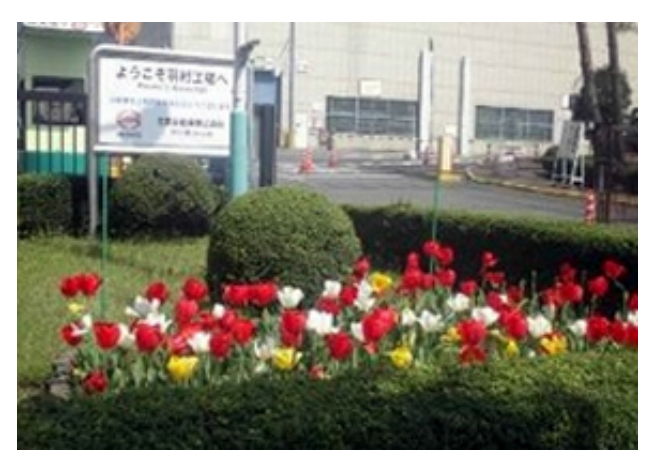
Hino Hutech Co., Ltd. participated in a flowergrowing contest in Hamura, a city in the Tokyo metropolitan area