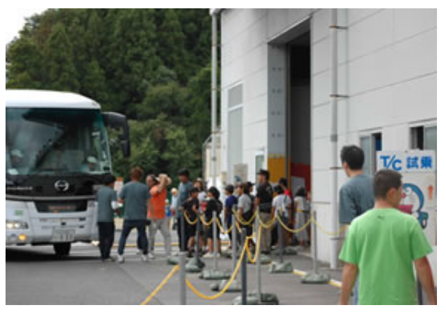
Hino Motors opens its Ibaraki Proving Ground to the public in the city of Hitachiomiya, Ibaraki Prefecture, Japan

Local communities learned more about Hino Motors via its participation in local industry festivals and other events.