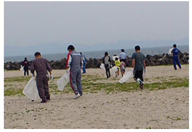
NEW Shimane Hino Motor Ltd. participated in a beach cleanup in Tottori Prefecture, Japan