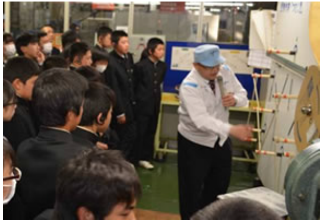
Sawafuji Electric Co., Ltd., gives tours of its plant in Gunma Prefecture, Japan