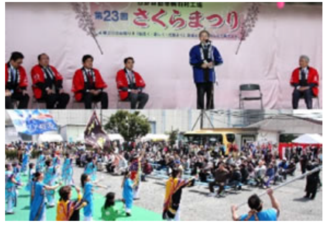
The Hamura Plant held a cherry blossom festival in Tokyo, Japan

Hino Motors' Plants and offices expressed appreciation to their communities by holding various events for the public in fiscal 2012.