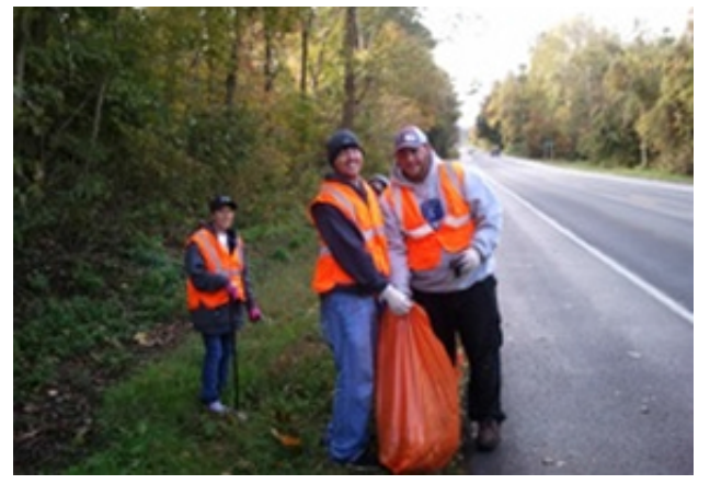
Hino Motor Manufacturing U.S.A. Inc. cleaned up the roads surrounding its Plant in the United States