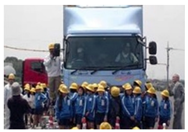
Traffic safety classes for elementary and junior high school students were held by the Koga Plant in Ibaraki Prefecture, Japan with a heavy-duty truck provided by Chiyoda Unyu Co.,Ltd.