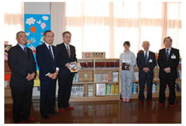
Hino Motors donated a "Hino library" of books to primary and junior high schools near its Memuro Proving Ground in Hokkaido, Japan

In communities where it operates in Japan and various other countries, Hino Motors has donated items to senior citizens' homes and to schools, as well as toys and clothing to underprivileged children.