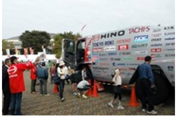
The Koga Plant joined the Sanwa Industry Festival in the city of Koga, Ibaraki Prefecture, Japan