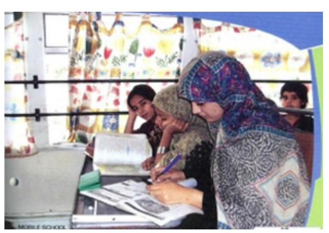
The mobile school bus returned from repair services A class being held in the bus

Hino Motors' sales agent in Taiwan, Hotai Motor Co., Ltd., provided a blood-donation bus to the Tainan Blood Center as part of its social contribution activities.