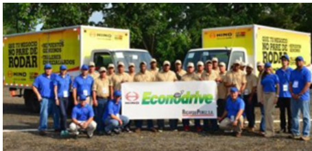
Eco-driving seminars in Panama

Hino Motors' distributors around the world offer eco-driving seminars for customers. The distributors provide practice vehicles and prepare driving circuits so that participants can directly experience the benefits of driving economically. The seminars were held in 25 countries and regions in fiscal 2015, with about 16,000 drivers participating. Hino Motors is working together with its distributors to administer the seminars by providing learning materials and useful information.