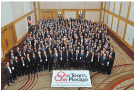
Hino Motors Total Support World Business Meeting 2015

In addition, regional representatives exchange views and discuss fiscal year policies at conferences held annually in various regions, including Central and South America and the Middle East.