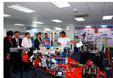
The showroom at the Hino Total Support Customer Center