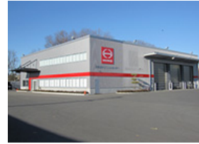
The Customer Technical Center

Hino Motors established the Customer Technical Center in 2005, the first permanent customer-oriented training facility for driving in Japan directly managed by a vehicle manufacturer. The center works closely with dealers to provide customers with training on fuel-efficient and safe driving techniques. The cumulative number of visitors reached 70,000 in April 2016.