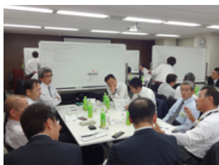
A scene from the conference (After-Sales Service)

The conferences are held for the purpose of strengthening the Hino Motors Group after-sales service network. Participants engage in Group discussions concerning the wide-area after-sales service structure in the After-Sales Service Department, and key points about inventory management and business operations in the Parts Department. Hino Motors intends to continue holding the conferences with the belief that having the frontline staff of its dealers share information on challenges and problem-solving will lead to better quality service.