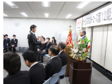
Scene from the opening ceremony