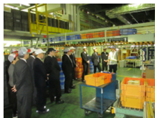
Participants toured Ome Parts Center

Hino Motors holds an after-sales service conference for managers every year for its distributors outside Japan. The event provides an opportunity for managers in charge of operations in each country to share information on their respective customer support activities, which, in turn, stimulates initiatives for improving after-sales activities and developing new after-service products. In fiscal 2015, a global conference for after-sales service managers worldwide was held, with 97 representatives from 55 countries participating.