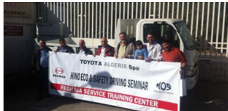
Eco-driving seminars in Algeria

Comment from participant in eco-driving seminar