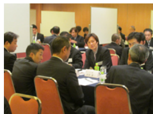
A scene from the conference (Parts)