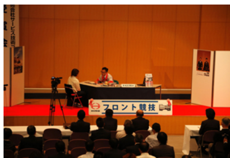
Competition for service skills