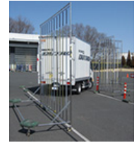
A training session on safe driving