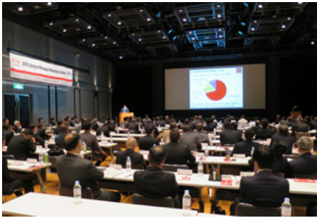
After-Sales Service Conference for managers