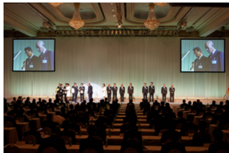
Award ceremony at a conference for dealers