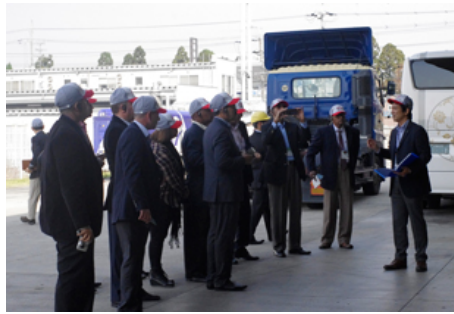
Visiting dealer in Kyoto