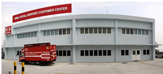
The Hino Total Support Customer Center

Since opening, visitors to the facility have continued to increase, with a cumulative total of more than 700 visitors. Hino Motors will engage in consultations and discussions with dealers in other countries, with a view to opening similar facilities in other markets in the future.