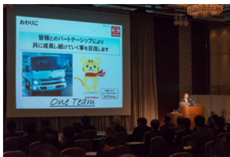
General meeting for suppliers