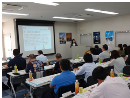
A scene from training programs for customers

Hino Motors is presently offering its customers in Japan a total of 41 programs divided into categories such as environment and human resources development. In fiscal 2015, Hino Motors added a new program of training seminars for fleet managers (freight), and it strives to bolster its community-based support.