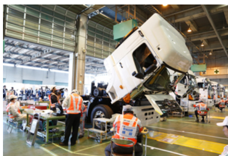
Competition for vehicle repair skills

In addition, a service skills competition for dealers across Japan takes place every year. Held for the 44th time in 2015, the competition enhances the vehicle repair skills of service engineers and the customer service capabilities of frontline advisors by enhancing their techniques so they can provide high-quality services for the customers.