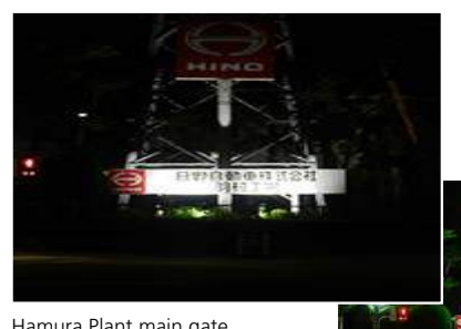
Hamura Plant main gate unlit at night

Since 2007, Hino Motors has been participating in the Lights Down Campaign, an activity in Japan in which companies across the country turn off their lights to save energy. Hino Motors' main business sites turn off their illuminated signboards and other lights for the campaign. A large number of Group companies also participate in the campaign, including domestic dealers.