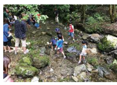
Fish catching experience (experiential events)

The Hino Green Fund was established in 1991 to promote and foster environmental activities in Japan. Each year, the fund provides about 15 organizations with grants. Recognized for its dedication to addressing environmental issues, the Hino Green Fund received Japan's Environment Minister's Award in fiscal 2005. Going forward, the Hino Green Fund plans to continue providing steady and reliable assistance to various programs and activities and to conduct events.