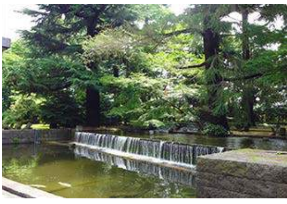
Hinodai no Mori

Looking ahead, Hino Motors will continue to maintain and protect this natural treasure.