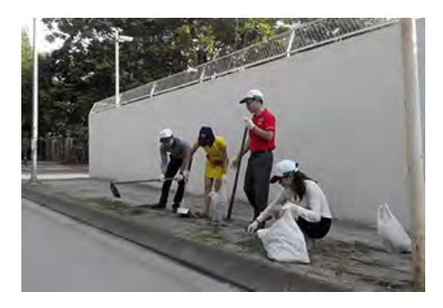
Cleanup activities were carried out in the neighborhood surrounding the office of Hino Motors Vietnam, Ltd. in Hanoi, Vietnam