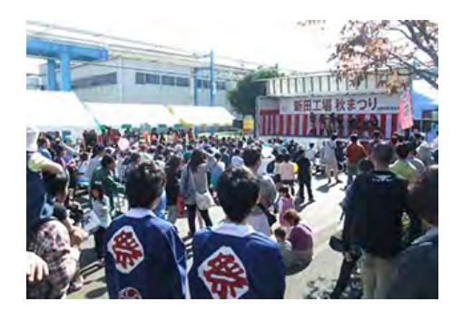
The Nitta Plant held an autumn festival in Gunma Prefecture, Japan

Hino Motors deepened its relationship with local communities by participating and extending cooperation in local industry festivals and other events.