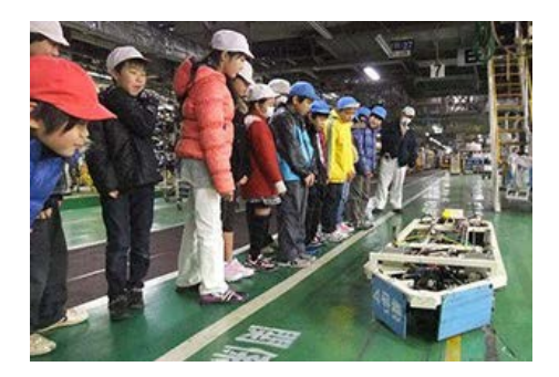
A tour of the Hamura Plant in Tokyo, Japan

Hino Motors' Hino Plant, Hamura Plant, and other plants along with a number of group companies in and outside Japan held factory tours for elementary and high school students and carried out internship programs to support education.