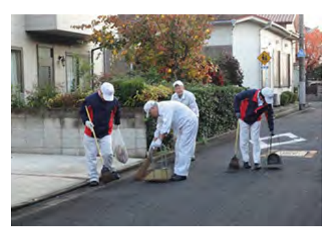
Cleanup activities were carried out in the neighborhood surrounding the Hino Plant of Hino Motors, Ltd. in Tokyo, Japan.