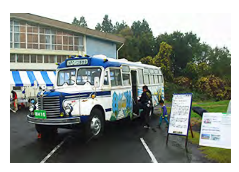
Hino Motors participated in the local Gozenyama Festival in Ibaraki Prefecture, opening its proving ground to the public