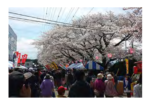
The Hamura Plant held a cherry blossom festival in Tokyo, Japan