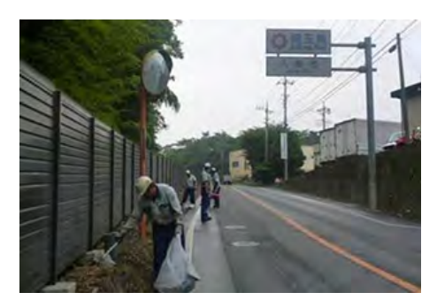
Cleanup activities were carried out in the neighborhood surrounding the office of Soushin Co., Ltd. in Saitama Prefecture, Japan