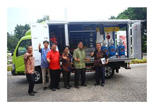
The donated vehicle is used to make repairs of buses used for public transportation in Jakarta, Indonesia

PT. Hino Motors Manufacturing Indonesia and PT. Hino Motors Sales Indonesia jointly donated a repair vehicle to be used for maintaining public buses.