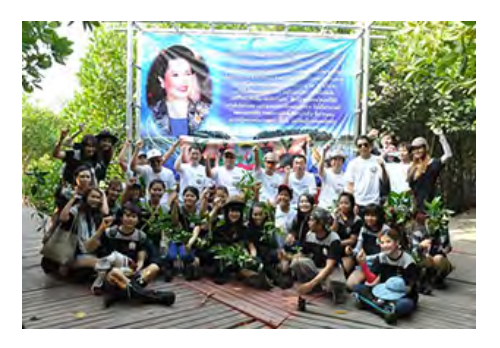
Employees of J.Filter Co., Ltd. planted trees in a mangrove forest in the province of Chachoengsao, Thailand

An initiative to protect sea turtles was jointly carried out by PT. Hino Motors Manufacturing Indonesia, PT. Hino Motors Sales Indonesia, and Hinopak Motors, Ltd.