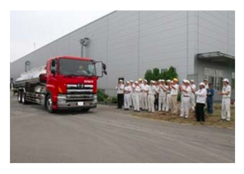
The water tank truck dispatched from the Koga Plant in Ibaraki Prefecture, Japan

NEW Hino Motors dispatched a water tank truck used at its Koga Plant to areas damaged by torrential rains brought by Typhoon No. 18 and donated funds to those in need.