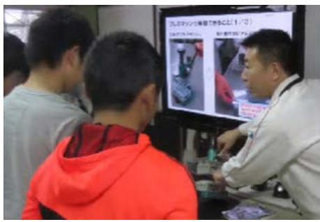
A member of the Hino Motors Managers Association volunteered his time to teach classes at Ishinomaki Elementary School in Miyagi Prefecture, Japan

Copyright © 2014-2015 Hino Motors, Ltd. All rights reserved