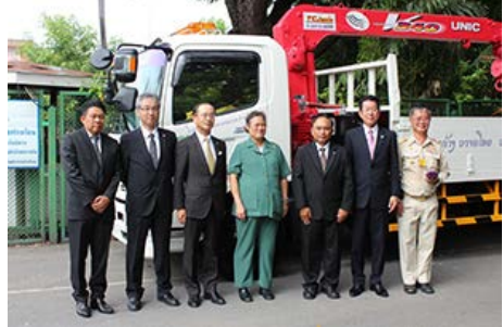
At the presentation ceremony with Princess Maha Chakri Sirindhorn in Bangkok, Thailand

PT. Hino Motors Manufacturing Indonesia and PT. Hino Motors Sales Indonesia jointly donated a repair vehicle to be used for maintaining public buses.