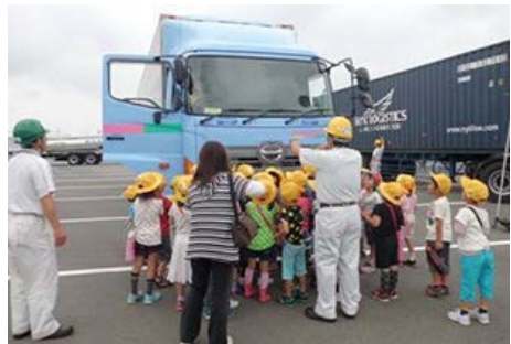
Traffic safety classes were held by the Koga Plant in Ibaraki Prefecture, Japan with a heavy-duty truck provided by Chiyoda Unyu Co., Ltd.