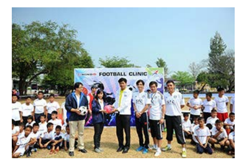
Members of Hino Motors Sales (Thailand) Ltd. gave soccer lessons in Thailand

Hino Motors and its dealers around the world donated vehicles and engines to auto mechanic vocational schools for use in teaching.