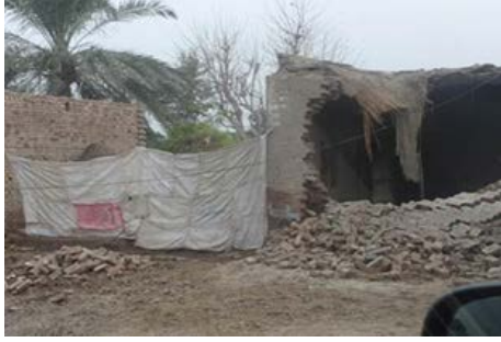
Donating utensils and bedding supplies to flood victims in Punjab, Gilgit Baltistan, Azad Jammu & Kashmir regions, Pakistan