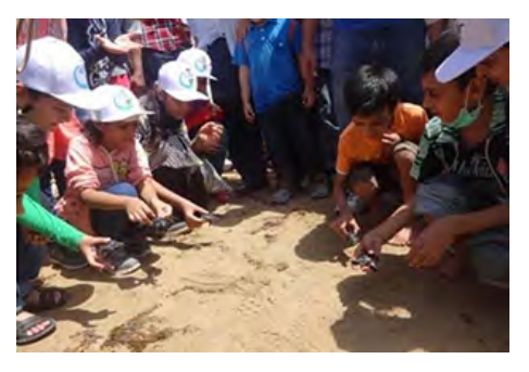
Young turtles were set free on Sandspit Beach Krachi, Pakistan