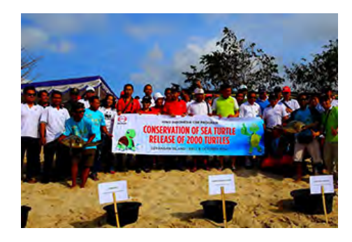
Young turtles were freed on Bali's Selengan Island in Indonesia

An initiative to protect sea turtles was jointly carried out by PT. Hino Motors Manufacturing Indonesia, PT. Hino Motors Sales Indonesia, and Hinopak Motors, Ltd.