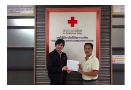
A monetary donation was presented by a representative of Thailand-based J-Filter Co., Ltd. in Thailand.

NEW Hino Motors Manufacturing (Thailand) Ltd., J-Filter Co., Ltd., Koshin Seikosho, Ltd., and Saitama Kiki Co., Ltd. donated funds to earthquakedamaged areas in Nepal.