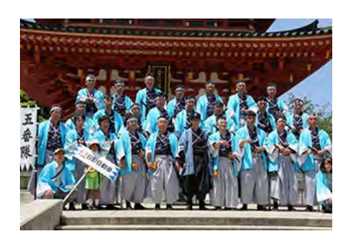
Hino Motors' Managers Association voluntarily participated in the Shinsengumi Festival, a traditional event held in the city of Hino, Tokyo, Japan