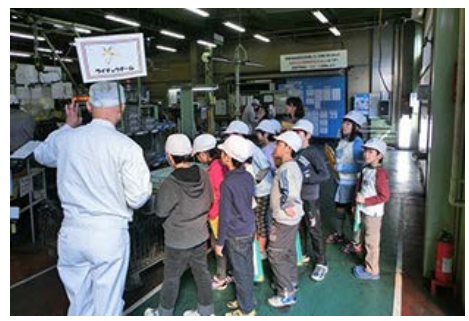
Saitama Kiki Co., Ltd. gave tours of its Plant in Saitama prefecture, Japan