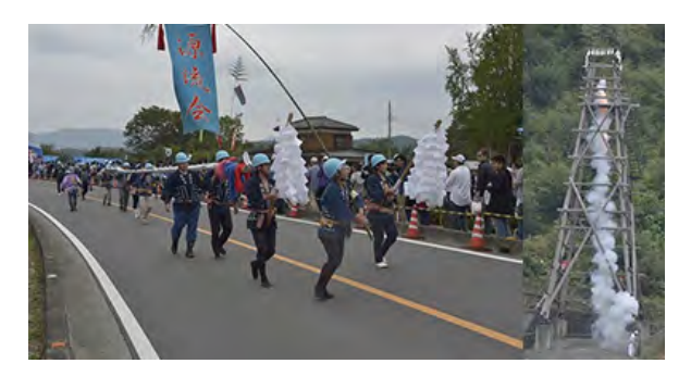
Saitama Kiki, Co., Ltd . participated in the Chichibu Ryusei Festival in Saitama Prefecture, Japan