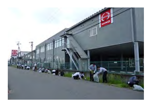
Employees of Gifu Hino Motor Ltd. clean up the neighborhood in Gifu Prefecture, Japan