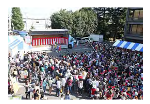
The Headquarters and the Hino Plant held an autumn festival in Tokyo, Japan

Hino Motors and its Group companies expressed appreciation to their communities by holding various events for the public at their sites