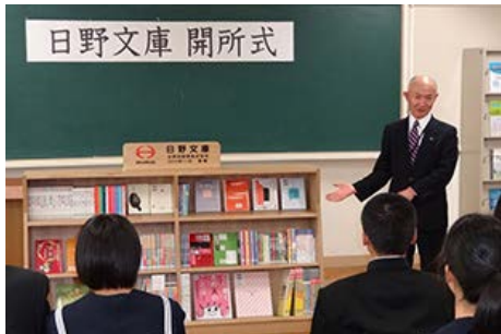
A Hino library of books donated in Hokkaido, Japan

Hino Motors and its Group companies organized the lessons in design and sports for local children