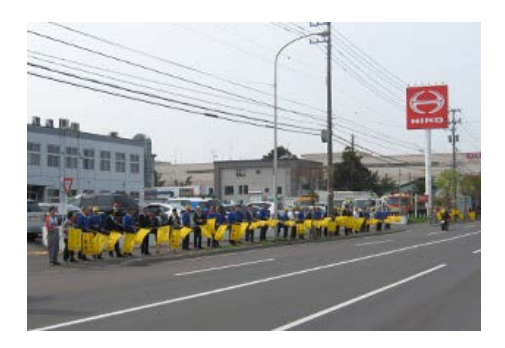
Traffic safety promotion activities were held by Hokkaido Hino Motor Ltd. in Hokkaido, Japan * Activities for raising awareness of traffic safety and notifying drivers to slow down and use seat belts

NEW Nagano Hino Motor Ltd. celebrated its 60th anniversary with the donation of wheelchairs to Nagano Prefecture, Japan.