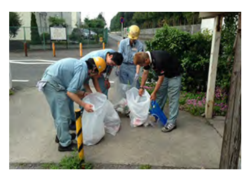
Cleanup activities were carried out in the neighborhood surrounding the office of Takebe Tekkosho Co., Ltd. in Kanagawa Prefecture, Japan