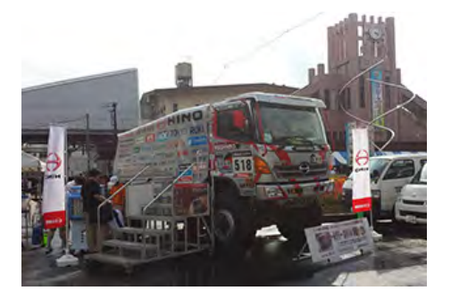
The Hamura Plant joined a summer festival in Hamura, Tokyo, Japan