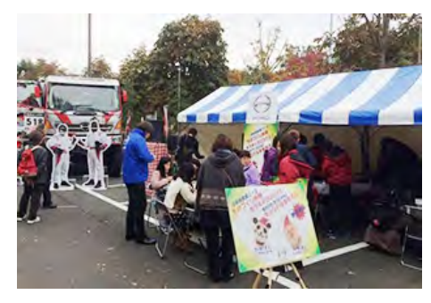
Hino Motors took part in a festival in Hino City in Tokyo, Japan, where its Headquarters and plant are based

Hino Motors deepened its relationship with local communities by participating and extending cooperation in local industry festivals and other events.