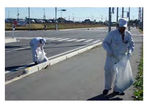
Cleanup activities were carried out in the neighborhood surrounding the Koga Plant of Hino Motors, Ltd. in Ibaraki Prefecture, Japan.