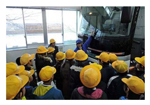
J-Bus Ltd, gave tours of its Plant in Ishikawa Prefecture, Japan