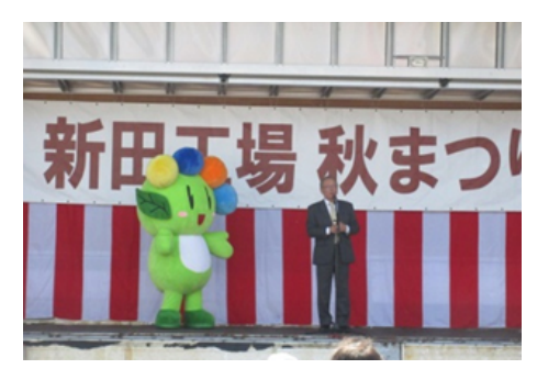
The Nitta Plant held an autumn festival in Gunma Prefecture, Japan