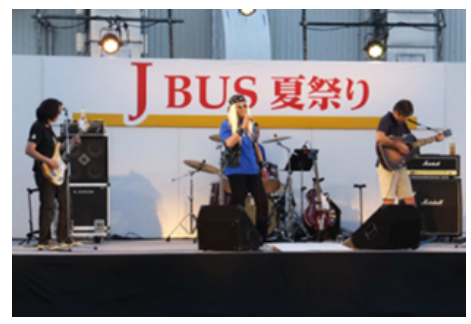
J-Bus Ltd. held a summer festival in Ishikawa Prefecture, Japan