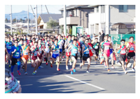
Sankyo Radiator Co Ltd. provided support for the Iruma City Ekiden Relay Race in Saitama Prefecture, Japan