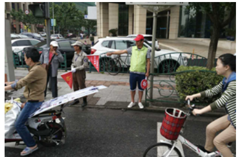
Shanghai Hino Engine Co., Ltd. helped with traffic safety in Shanghai, China