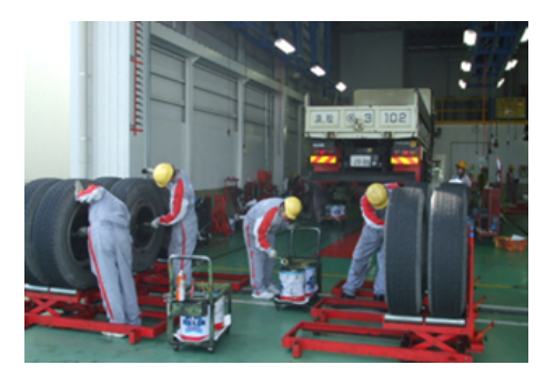
Shizuoka Hino Motors, Ltd. held hands-on learning sessions for junior high school students in Shizuoka Prefecture, Japan