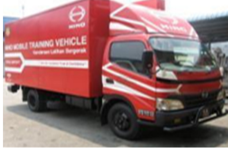
Hino Motors Sales (Malaysia) Sdn. Bhd. donated a vehicle and engines for training in Malacca, Malaysia