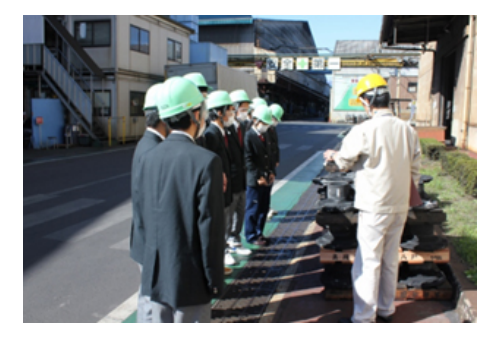
Fukushima Steel Works Co., Ltd. held factory tours in Fukushima Prefecture, Japan