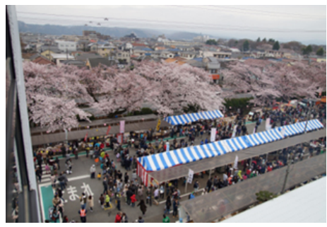
The Hamura Plant held a cherry blossom festival in Tokyo, Japan