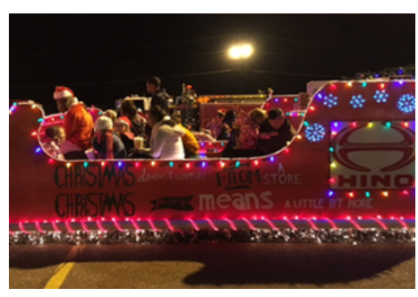
Hino Motors Manufacturing U.S.A., Inc. participated in holiday events in Arkansas, USA