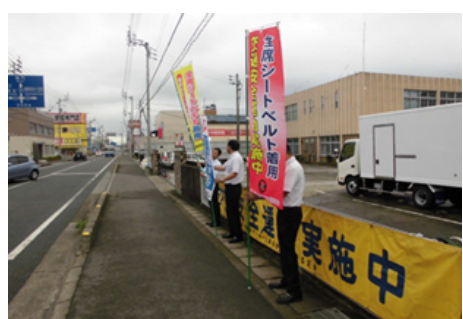
Tokushima Hino Motors, Ltd. conducted traffic safety monitoring and surveillance in Hiroshima Prefecture, Japan