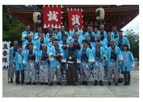
Hino Motors participated in the Hino Shinsengumi Festival in Tokyo, Japan