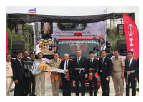
The donated truck in Maha Sarakham Province, Thailand.

Hino Motors Sales (Thailand) Ltd. and the Japanese government donated a water tank truck to Northeastern Thailand, which suffering from a water shortage.