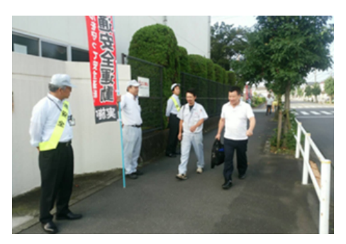
Sankyo Radiator Co., Ltd. conducted traffic safety monitoring and surveillance