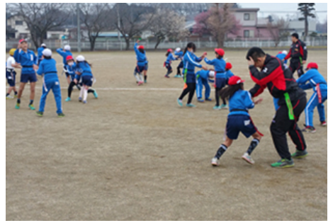
Children in Tokyo were coached by HinoMotors' rugby club in Tokyo and Ibaraki Prefecture, Japan