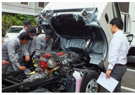
Kyoto Hino Motors, Ltd. dispatched lecturers to vocational schools in Kyoto Prefecture, Japan