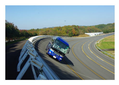
Hino Motors participated in the local Gozenyama Festival in Ibaraki Prefecture, opening its proving ground to the public

Hino Motors deepened its relationship with local communities by participating and extending cooperation in local industry festivals and other events.