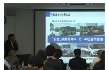
Environmental technology seminar

Hino Motors recognizes the importance of external communications. The Company seeks to provide timely and appropriate information on its business activities to ensure stakeholder understanding. In addition to information on the ordinary general shareholders' meeting and regular financial results statements, Hino Motors makes a variety of efforts to reach a broader audience with information about its business. These include disseminating information at the Tokyo Motor Show, holding a tour of the Koga Plant for shareholders in May, and providing a seminar on the latest advanced safety technology for the media in June.