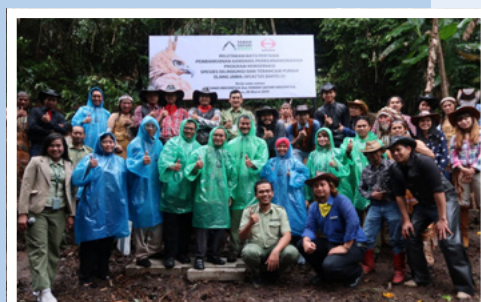
Partnering with a local safari park to conduct preservation activities for the Javan hawk-eagle

After joining the company, I was assigned a position that supports the legal department, and in August 2010 was selected to be a member of the HMSI CSR Committee. I feel a great deal of satisfaction with the endeavors of this committee, which promotes over 100 different CSR activities such as environmental conservation, health promotion, support for human resources creation, support for local culture, and support for recovery after a natural disaster.