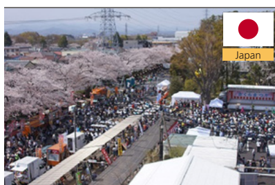
A SAKURA festival open to local residents