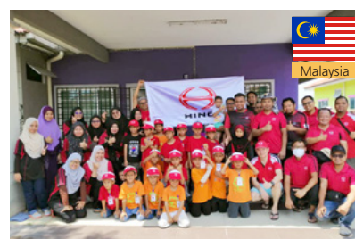
Donating food and stationery to the local orphanage and repair facilities