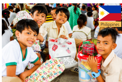
Donating toys to local children