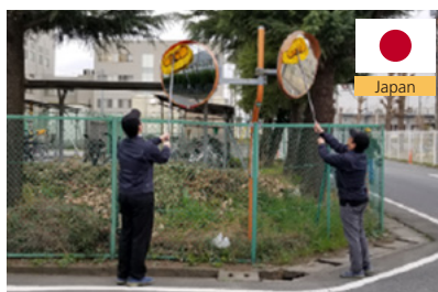
Cleaning traffic mirrors in the community (Sankyo Radiator Co., Ltd.)