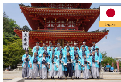
SHINSENGUMI FESTIVAL HINO CITY, TOKYO