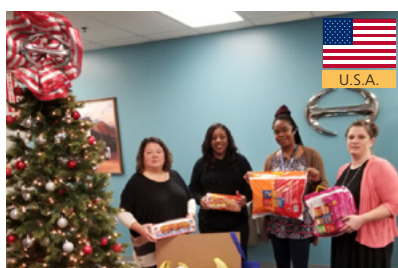
Donating Christmas gift to local children of poor families