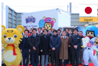
Supporting activities of a local baseball team called Saitama Musashi Heat Bears