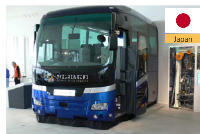
Exhibiting a real cut bus at the Science Hills Komatsu local science museum