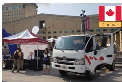
Introducing product safety and environmental technologies at a local JAPAN FESTIVAL (Hino Motors Canada, Ltd.)