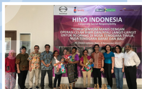
Offering free cleft lip/cleft palate surgeries