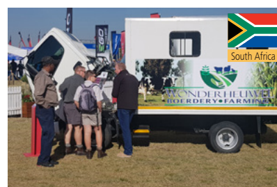
Exhibiting a full lineup at the South African Agricultural Trade Show (NAMPO); (Hino distributor: Toyota South Africa)