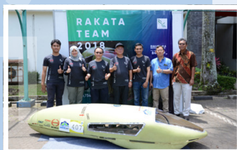
Supporting renewable energy development