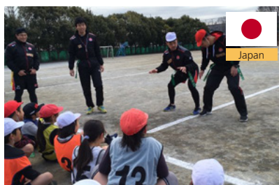
Tag rugby classroom for local elementary school students