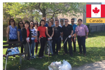
Community cleaning (Hino Motors Canada, Ltd.)