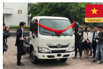
Donating trucks for regional university