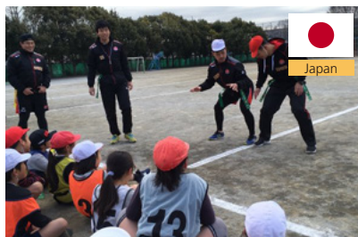
Tag rugby classroom for local elementary school students