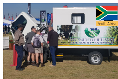
Exhibiting a full lineup at the South African Agricultural Trade Show (NAMPO); (Hino distributor: Toyota South Africa)