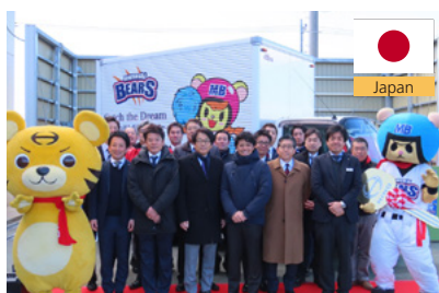
Supporting activities of a local baseball team called Saitama Musashi Heat Bears