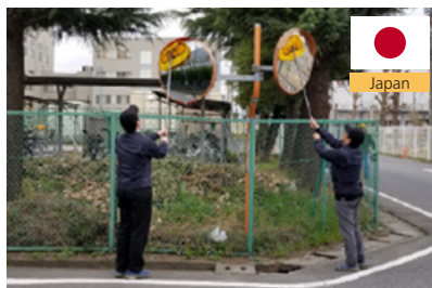
Cleaning traffic mirrors in the community (Sankyo Radiator Co., Ltd.)