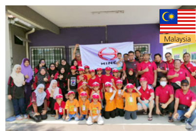
Donating food and stationery to the local orphanage and repair facilities