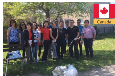
Community cleaning (Hino Motors Canada, Ltd.)