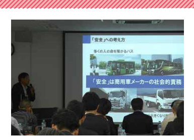
Environmental technology seminal

Hino Motors recognizes the importance of external communications. The Company seeks to provide timely and appropriate information on its business activities to ensure stakeholder understanding. In addition to information on the ordinary general shareholders' meeting and regular financial results statements, Hino Motors makes a variety of efforts to reach a broader audience with information about its business. These include disseminating information at the Tokyo Motor Show, holding a tour of the Koga Plant for shareholders in May, and providing a seminar on the latest advanced safety technology for the media in